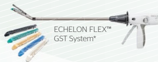
ECHELON FLEX™ GST System*