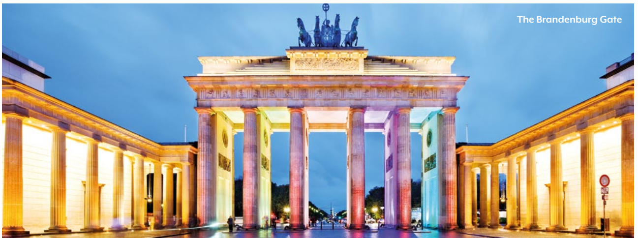
The Brandenburg Gate

The Euro is the currency used in Germany. Banks are usually open from Monday to Friday from 09:00 – 17:00.